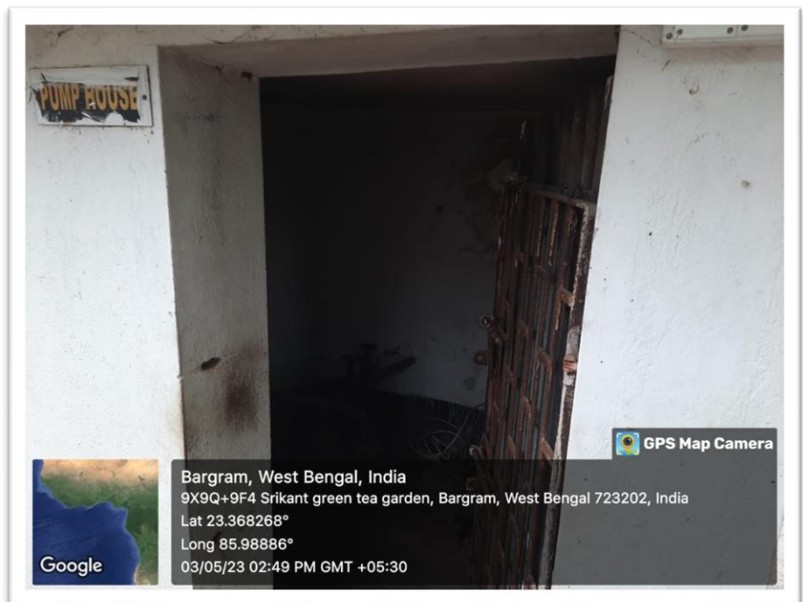
Pump House of Bore Well