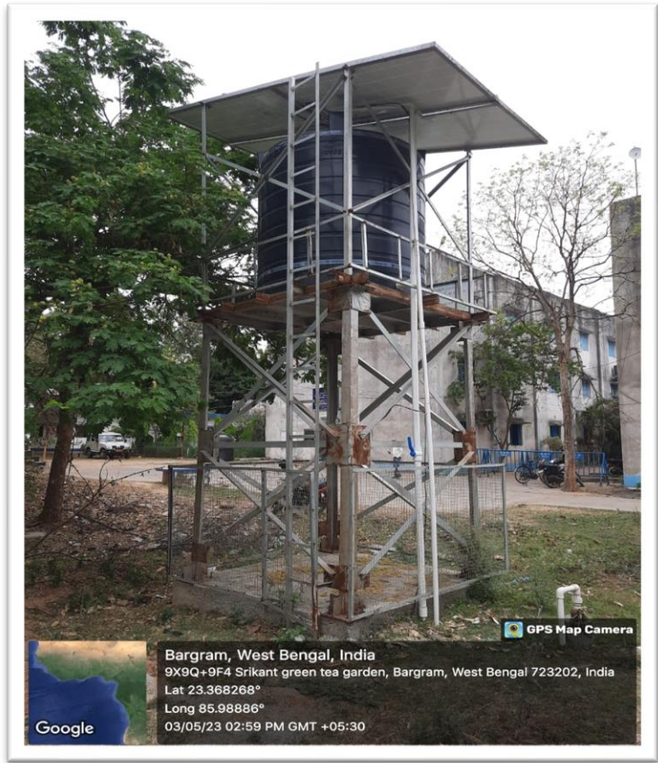
Solar Pump fitted Underground Boring with Water Tank