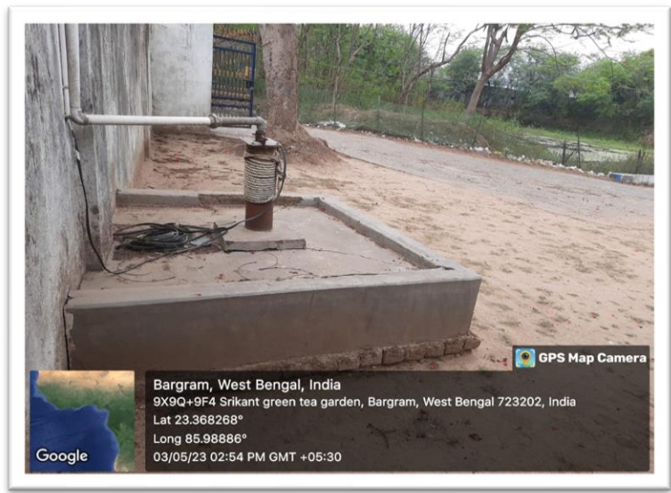
Electric Pump fitted Deep/Underground Boring